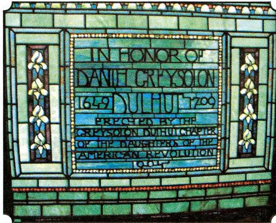
Bottom section of Tiffany's Daniel Greysolon Sieur duLhut window, now in entrance door of St. Louis County Heritage & Arts Center (the Depot)

these windows also make use of the Tiffany lead approach. Leaves and stems, foliage and small flowers are shaped in lead which creates a gentle, yet somber undertone to the windows conducive to prayer.